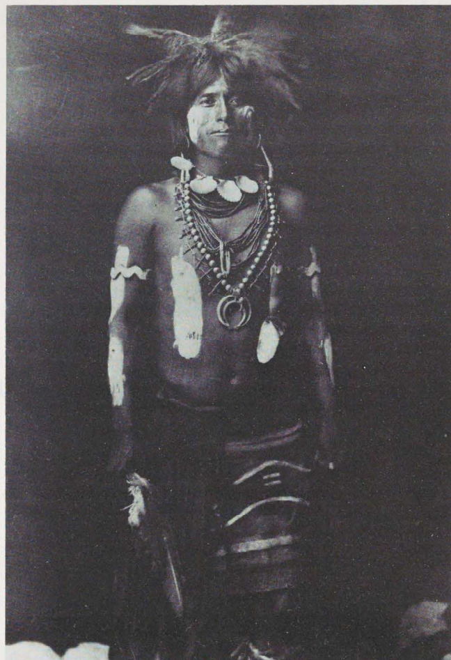
Figure 4 Hopi snake priest, 1904.

The popular—if not commercial—success of these performances probably prompted Curtis to think in terms of the increasingly popular form, the motion picture itself. Another unpublished typed script has an interesting third section: