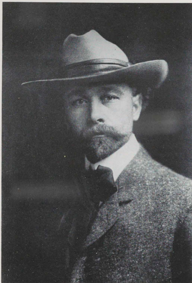
Figure 1 Edward S. Curtis, ca. 1905.