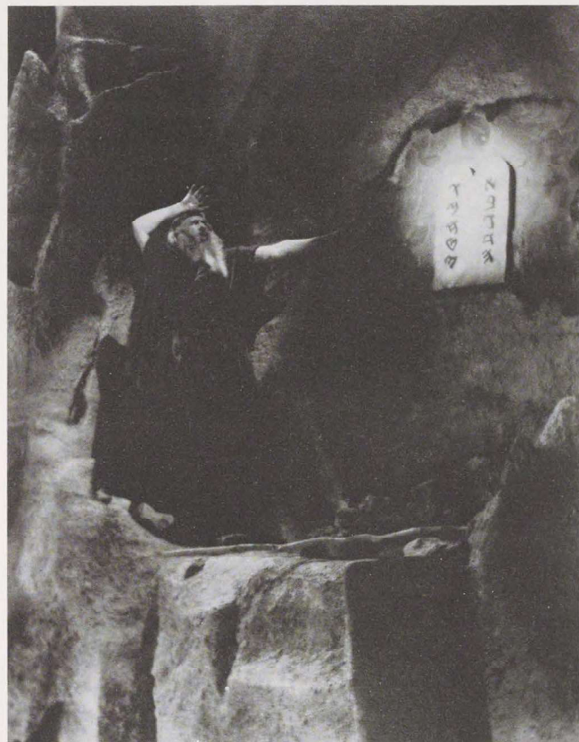
Figure 7 A scene from Cecil B. De Mille's The Ten Commandments , 1923, as photographed by Curtis. (Courtesy California Historical Society.)

I shipped the film yesterday and included in the case first the negative which I think is complete. However, fearing that it might not be, I have sent the positive to you; also, I have included about a thousand feet of extra negative as it may contain some bits which may be of value to you, and I also included a few pieces of positive print which may not be included in the assembled print. I am enclosing a bill covering the matter; also, it is understood by this letter that I relinquish any claim to the copyright upon the film.