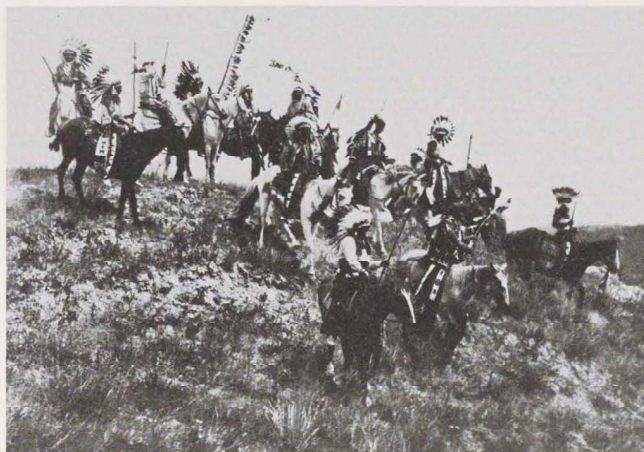
Figure 5 A group of Sioux reenact, for Curtis's camera, in 1907, a war party of days gone by.