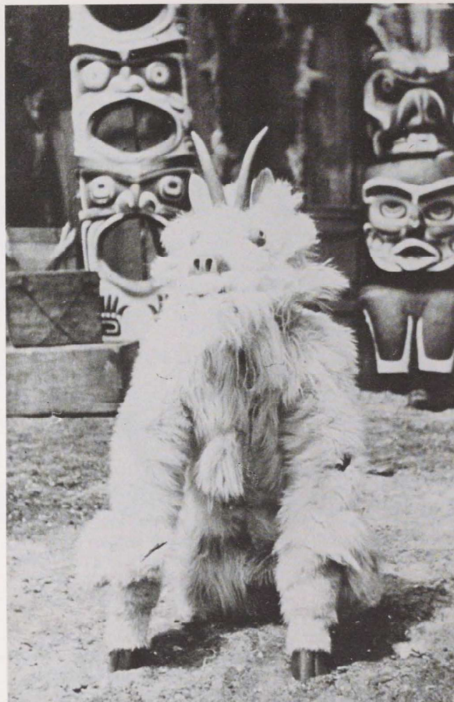
Figure 6 Goat, one of the Kwakiutl ceremonial figures filmed by Curtis for In the Land of the Head-Hunters in 1914. This is a previously unpublished photograph by Schwinke. ►